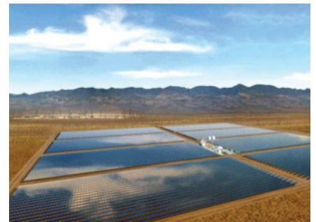
Centralized Solar Thermal